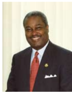
Mayor Harvey Johnson City of Jackson